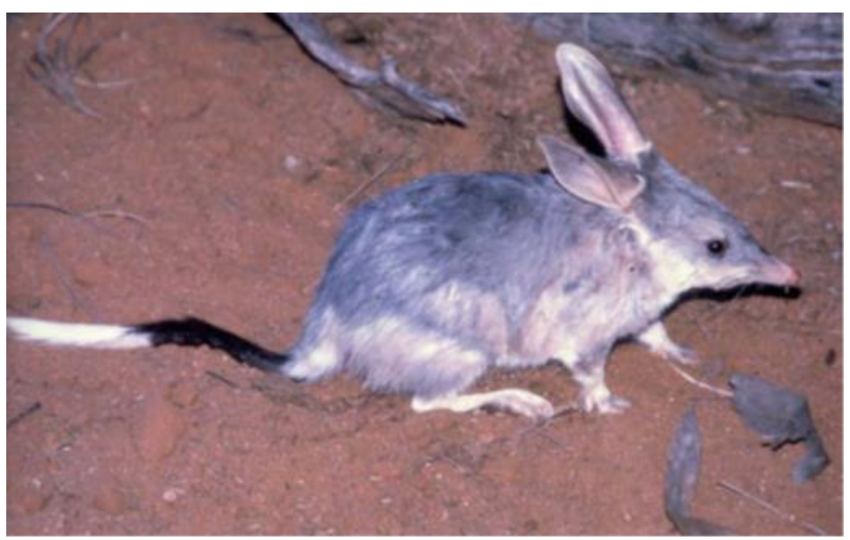
Greater Bilby.

The greater bilby ( Macrotis lagotis ) is a small (rabbit sized) marsupial from Australia's bandicoot family. It has a pointed snout, long pinkish ears, a long black tail with a white tip, and strong forelimbs and claws for burrowing and digging up food. Males are much larger than the females and can be up to 2.5 kg in weight. Each bilby moves between up to 12 burrows in their home range in response to food availability.