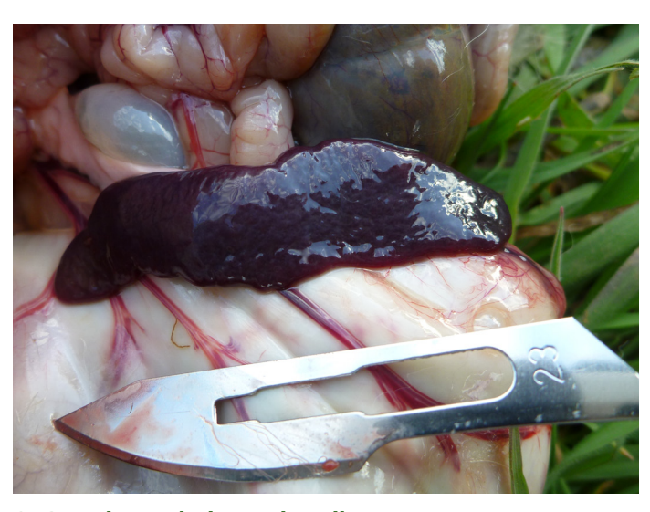
RHDV spleen - darker and swollen.

Source: R Dimitrov (2012) 'Comparative Ultrasonographic, Anatomotopographic and Macromorphometric Study of the Spleen and Pancreas in Rabbit (Oryctolagus cuniculus)'. Not Sci Biol, 4(3):14-20