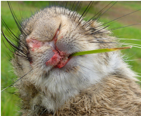
Left: Classic posture of RHDV carcass with chin raised.

Above: A bloody discharge may be present, but is rarely seen.