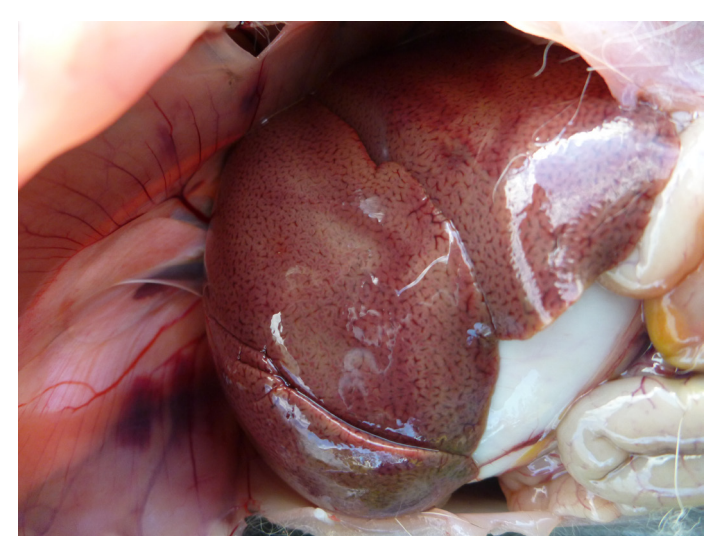
RHDV liver with characteristic pale reticulations.

The next indicator, which is a little less reliable but can add to your evidence is the spleen . It looks a bit like a burgundy-coloured slug attached to the side of the stomach. An RHDV spleen is often quite dark, even blackish, and enlarged compared to a non-RHDV rabbit, which is usually about 5cm long and 1cm wide.